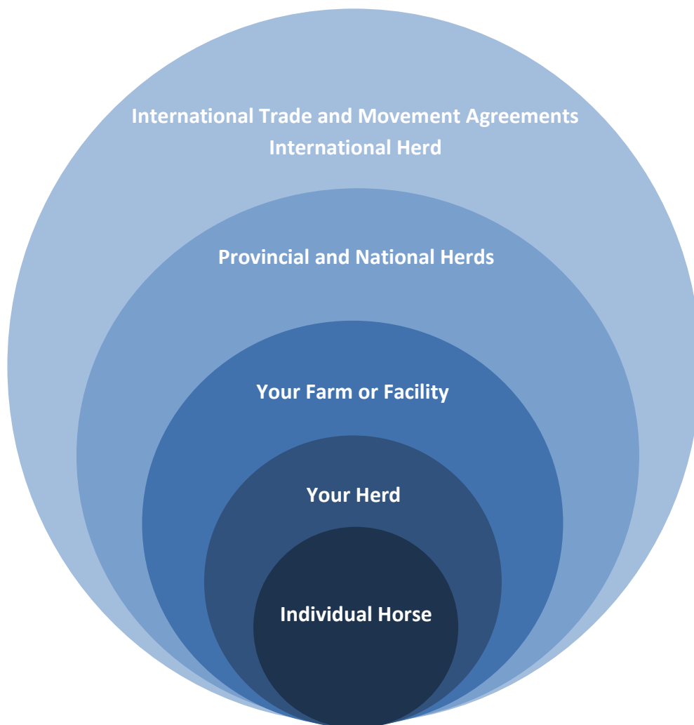
Figure 1: Your Horse – Part of a Larger Herd This diagram illustrates the relationship of an individual horse to the national and international horse industry. It emphasizes the impact that disease left uncontrolled from an individual horse can have on the horse industry in Canada. Modified from Equine Biosecurity Principles and Best Practices: Disease Transmission ; Government of Alberta.

Disease control and prevention is complex. This complexity is compounded by the inherent biosecurity challenges in the equine industry, including: