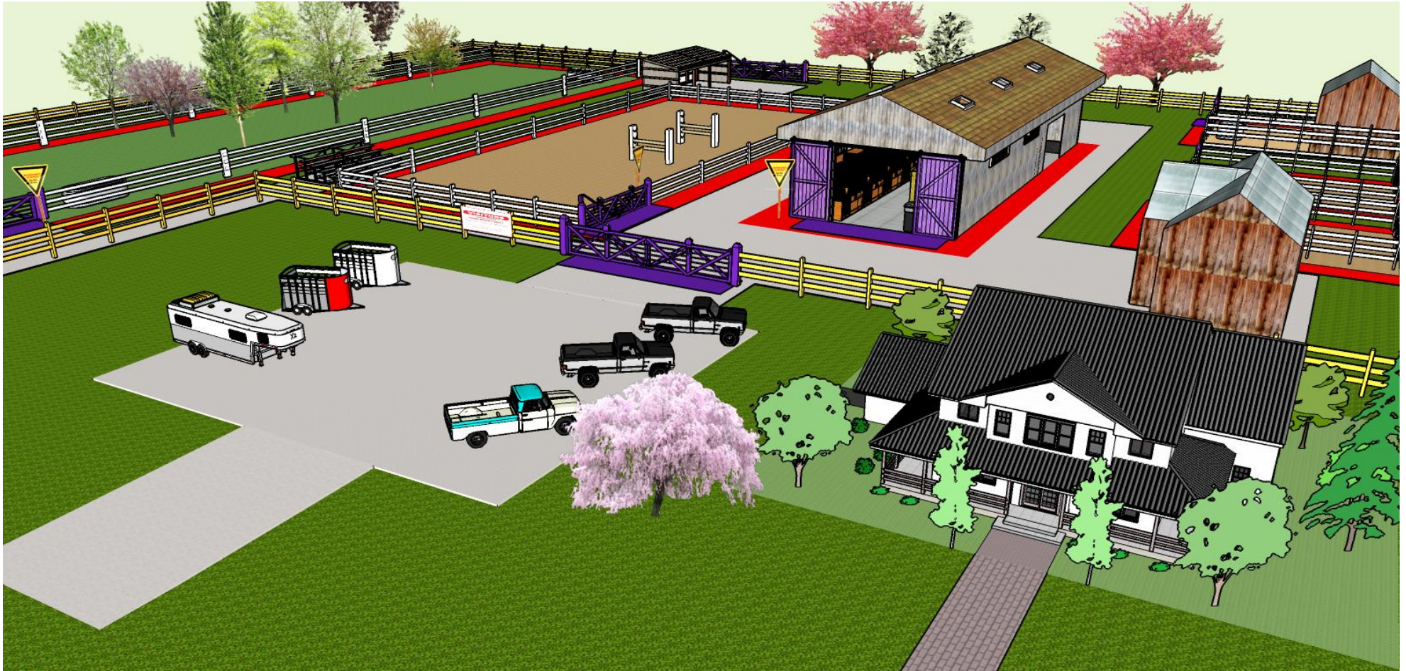
Figure 4: Zoning on a Horse Facility

An alternate view of the horse facility depicted in figure 3. Clockwise from the upper left: Pastured horses are separated from other horses on the property and traffic flow minimizes interaction with resident horses. Covered manure storage is located at the back edge of the property with a dedicated controlled access point (purple gate) allowing access and manure removal, minimizing entry into the property. The arena and resident horse barns are restricted access zones. Hard surface pathways facilitate movement around the property and completely surround the barn which is a high traffic area.