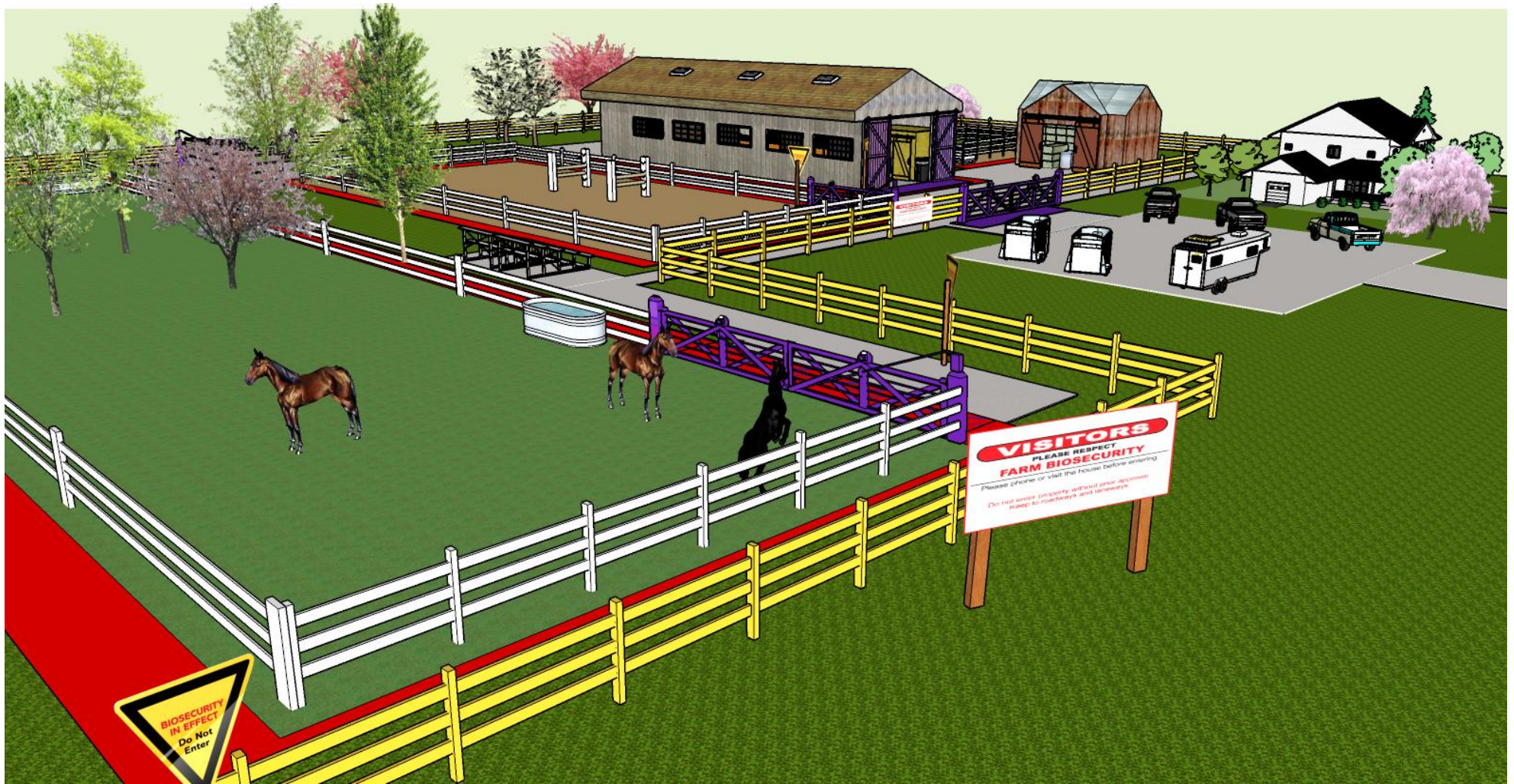
Figure 3: Zoning on a Horse Facility: A simple horse facility demonstrating the concept of two biosecurity zones. The controlled access zone (yellow fenced area) establishes a boundary between everything outside the facility and areas of the property involved in horse care and management. It provides the ability to manage the risks of the introduction of disease into areas where it may be easily transferred to horses and reduce the spread of disease off of the property. Storage areas for feed, bedding and manure and bleachers for viewing the arena are located in this zone. Restricted access zones (areas bounded in red) require stricter biosecurity and limit direct access to horses or the areas that they may reside. Controlled access points (purple gates) and signage assist in managing and directing traffic flow into and out of the controlled and restricted access zones. Parking for visitors is established outside the controlled access zone and a separate driveway and parking area is established for the property owner's house.