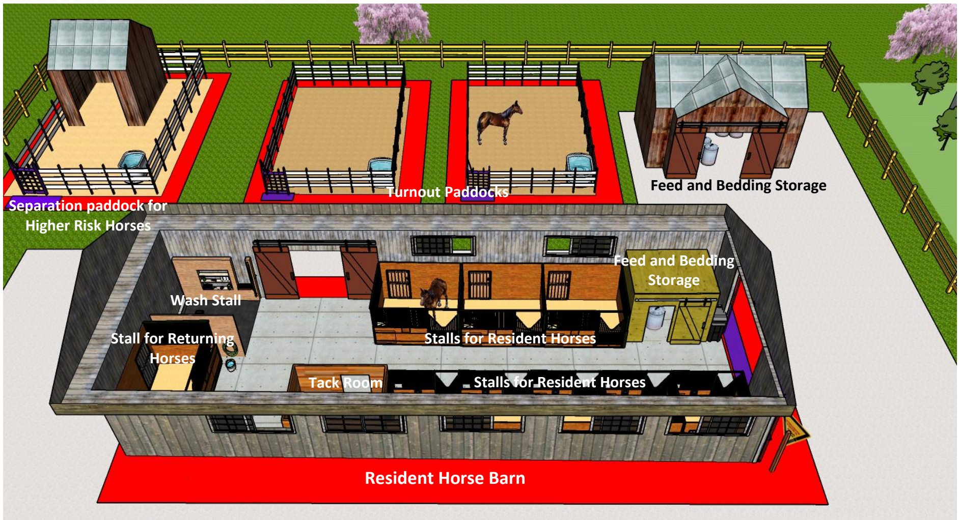
Figure 5: Example of facility layout and paddock separation: Separating the paddock and stabling areas for horses that have a different health status or belong to different peer groups assists in minimizing pathogen transmission and facilitates management of the horses on the farm or facility. The resident horse barn, turnout paddocks and separation paddock are all restricted access zones accessible through controlled access points (gates). The two day turnout paddocks are fully fenced and separated by more than 10 feet which prevents direct contact between horses and each is supplied with their own watering trough. New and returning horses can be separated in a stall at the end of the barn and a turnout paddock set aside for their use.

Ill horses require the highest level of biosecurity and, ideally, should be physically separated from other horses on the property (Separation Barn). Restrict entry to only those people necessary for the care of these horses and require hand washing before and after entry. Dedicate coveralls and footwear specifically for this barn or clean and disinfect boots on entry and exit. Dedicate and label all tack and equipment (buckets, rakes, shovels etc.) and ensure none of it is removed and used with other horses. If a separate location is not available, a stall that is isolated from other horses within the resident horse barn can be used, however, the shared air space and close proximity to other horses can result in the inadvertent transmission of pathogens by airborne routes and other indirect methods of contact.